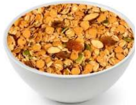
Quinoa Muesli with Fruits- Nuts & Seeds