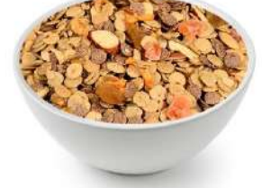
Multi Millet Muesli Fruits & Nuts