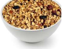
Toasted Oats Millet Muesli