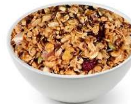
Quinoa Muesli Banana