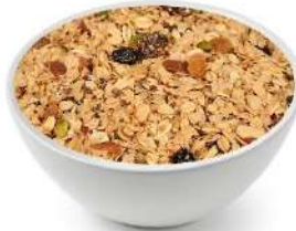
Muesli (No Added Sugar)