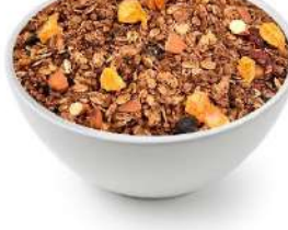
Chocolate Orange Muesli