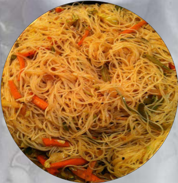
Various combinations of roasted vermicelli