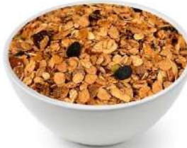
Honey & Nut Muesli