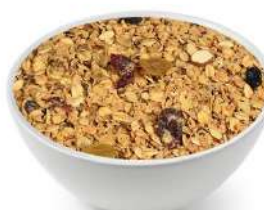
Crunchy Muesli Fruits-Nuts&Seed