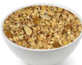
Multi Millet crunchy Muesli