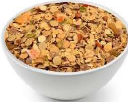
Horsegram Seed & Fruit