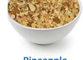
Pineapple Quinoa Cereal