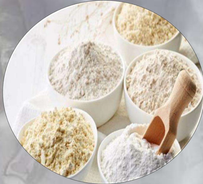
Various flours like wheat, corn, maida, rice etc