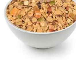
Multi millet Muesli horsegram