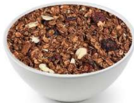
Vanilla Crunchy Muesli