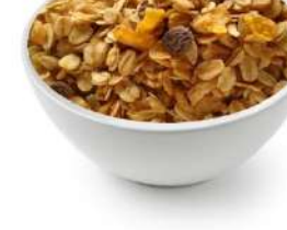
Millet with Raisin Cereal