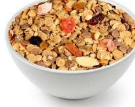
Multi Millet Muesli Fruits-Nuts & Berries