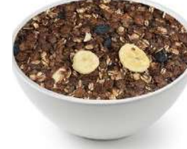
Muesli -Almond Choco Crunch