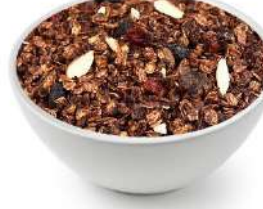
Choco delight Muesli