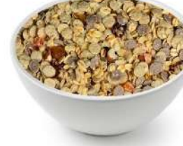
Mixed Fruit Muesli